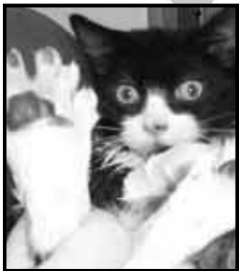
Big Paw McGraw